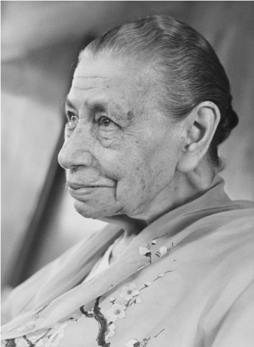
The Mother - 1969