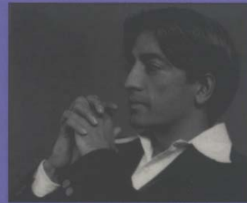
J. Krishnamurti, 1934.